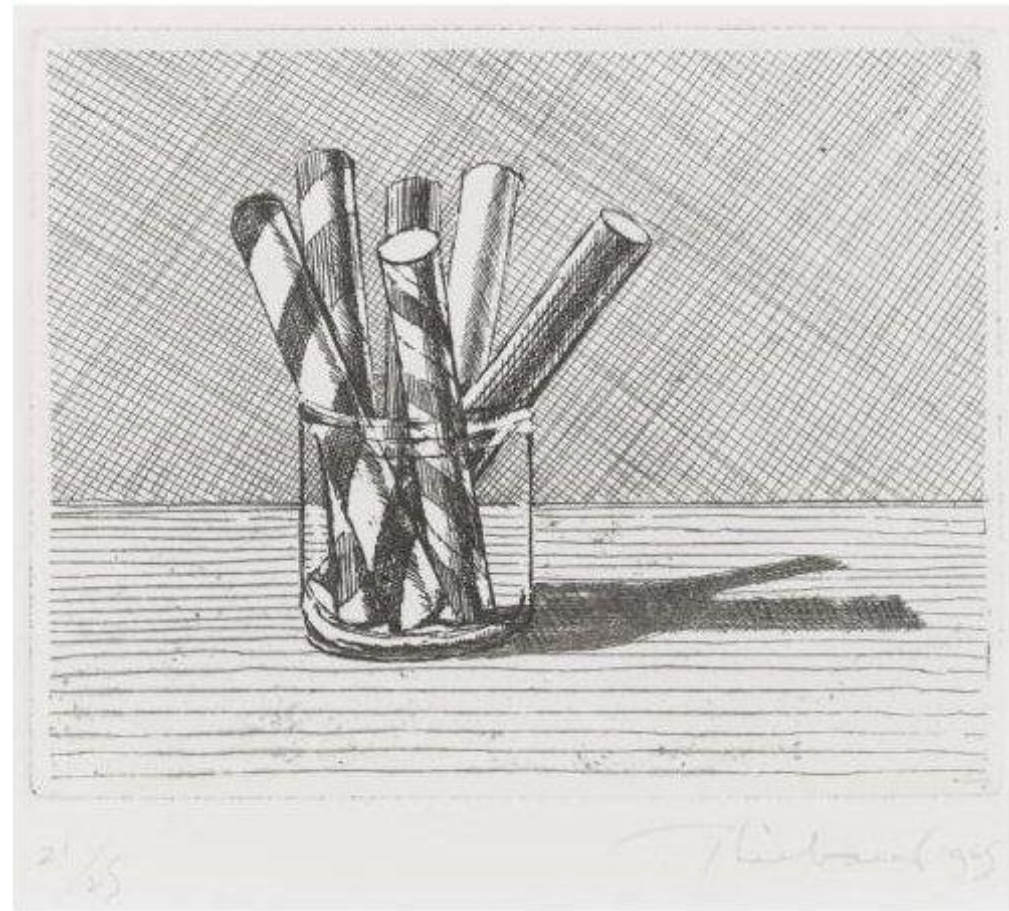
Wayne Thiebaud- ink drawing