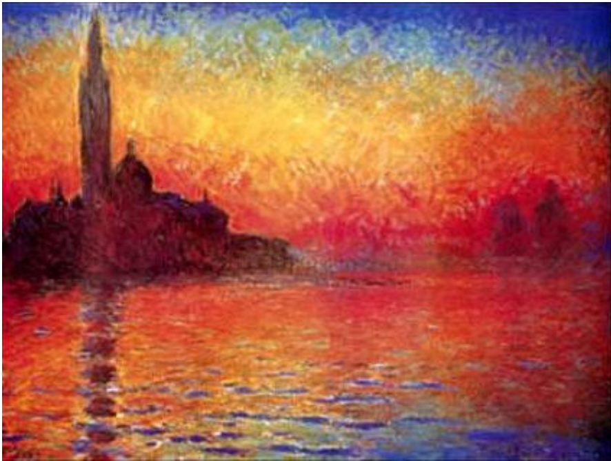
Claude Monet Venice Sunset 1908

Artists began rejecting traditional standards of painting and began experimenting with new techniques and ideas.