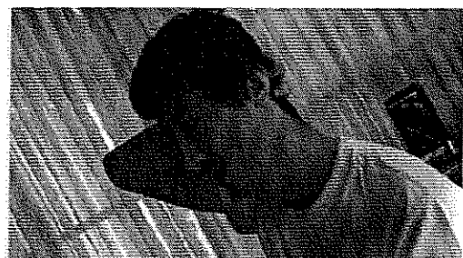
Realizing that the woman he loves had betrayed him