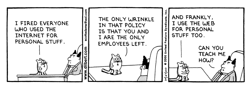
Fig. 1. This "Dilbert" comic strip suggests that personal Internet usage is widespread in the workplace (Adams 106).

Illustration has figure number, caption, and source information.